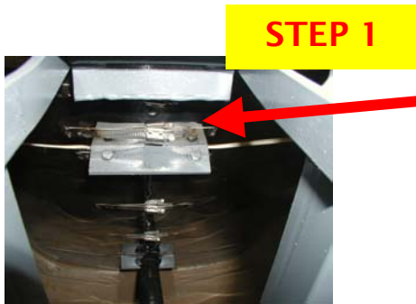
STEP 1 - Undo Bolts on Back of Kiln Firing Chamber