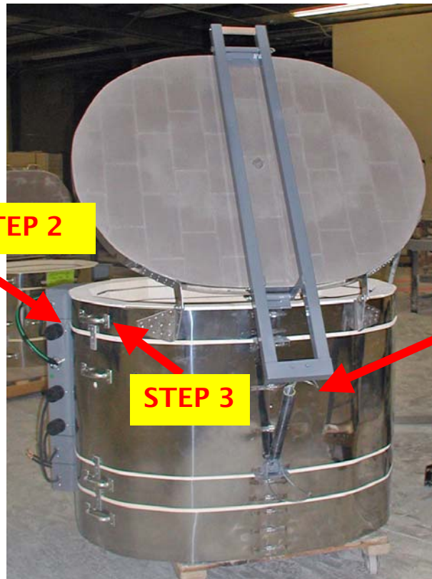
STEP 3 - Remove center screw with a Phillips screwdriver from top ring locks on either side of the top ring